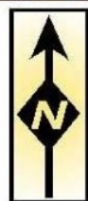
Map of Event Parking: