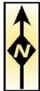
Map of Event Parking: